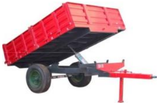
A typical Trolley & its axle visual

NEWBRAKING LEGISLATION: As agricultural tractor size and speeds have increased during recent years, heavier loads are transported on public roads at higher speeds. Due to the increased speed of tractors, their braking system has been enhanced. In view of the road safety, the braking systems of agricultural vehicles must meet a number of requirements for, among other things, braking efficiency, the follow-up action